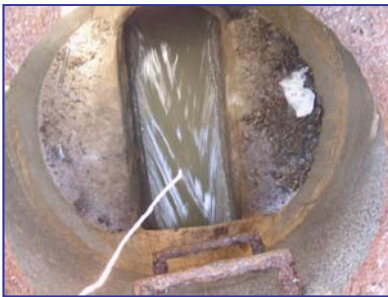
Flow measurements are taken throughout the collection system to determine the correct pump station upgrade size.

This project includes the upgrade of five pump stations. These upgrades are required to alleviate SSOs at and near the pump stations as well as in their respective upstream basins.